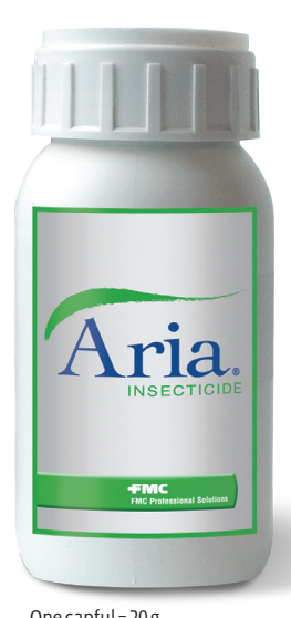
One capful = 20 g

For more information on Aria insecticide, contact your FMC Market Specialist or local FMC Distributor.